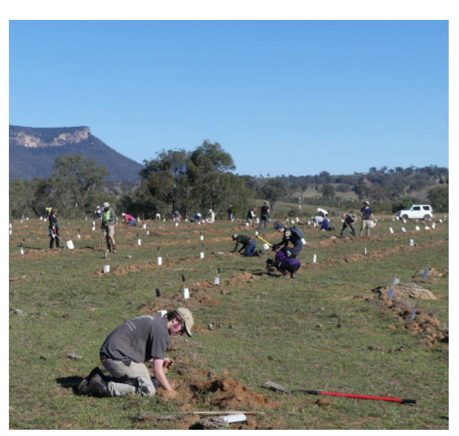
Tree planting in the Capertee Valley, 2018

In 1994, a national project to stem the decrease in population of the Regent Honeyeater was set up with a coordinating team drawn from a wide range of relevant organisations from its three home states (Queensland, NSW and Victoria). This Regent Honeyeater Recovery team developed a multi-pronged