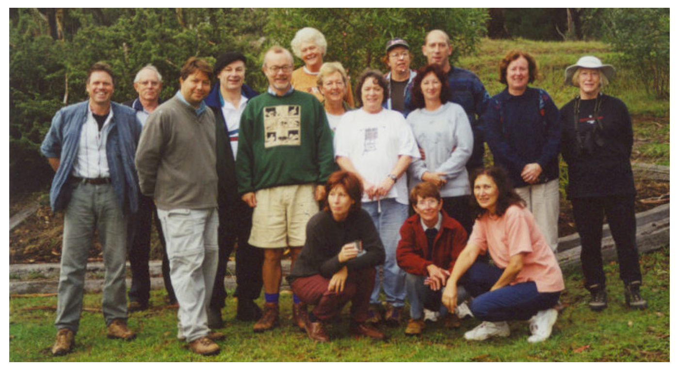
The Bathurst Survey group, 2000