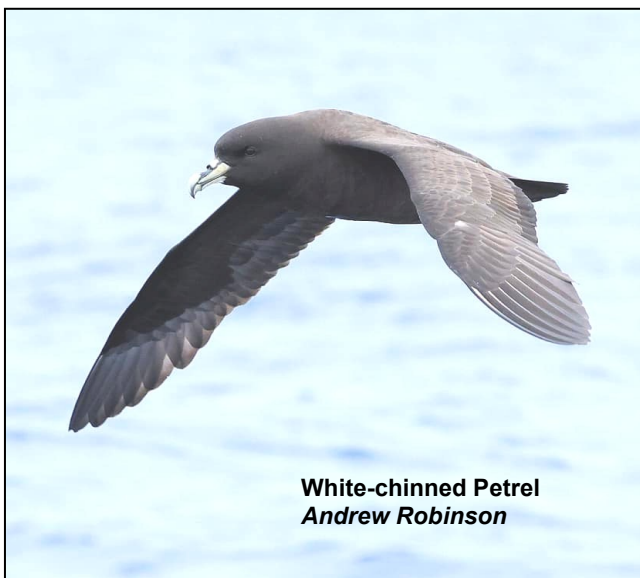
White-chinned Petrel

After a cracking few hours at the shelf, it was time to head for shore, but not before a few more species were added to the trip list when a White-faced Storm Petrel appeared on the slick and a Hutton's Shearwater offered mid-range views. As was the case on the way out, the return trip was rather monotonous with mostly Short-tailed Shearwaters and the odd Shy and Black-browed Albatross being seen.