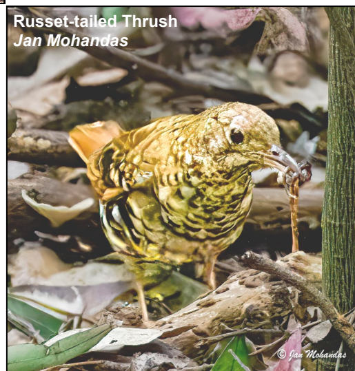
Russet-tailed Thrush Jan Mohandas

Our final day was spent in the Manning Valley, starting first at Wingham Brush rainforest, where the Flying Foxes noise and smell was overpowering. However, we managed to see plenty of brilliantly coloured Brush Turkeys maintaining their mounds, White-headed and Topknot Pigeons, all three Scrub-wrens, Rufous & Grey Fantail and an Azure Kingfisher. There was only one Russet-tailed Thrush but everyone obtained great views. All up 28 species. We took morning tea here before heading to Bootawa Dam (Taree's water supply dam). Highlights here were Wedge-tailed Eagle, 3 Hoary-headed & 12 Great Crested Grebes, Wonga Pigeon, Hardheads and a White-winged Triller was calling. From here we found our way through Tinonee, Old Bar and then onto Saltwater NP, Wallabi Point, where we had lunch. Our lunch was interrupted by the many Regent and Satin Bowerbirds, Koel, Lewin's Honeyeater, Varied Triller and Figbird feeding on a fruiting tree in the Picnic Area.