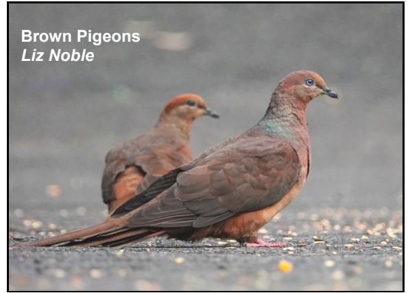
Brown Pigeons Liz Noble