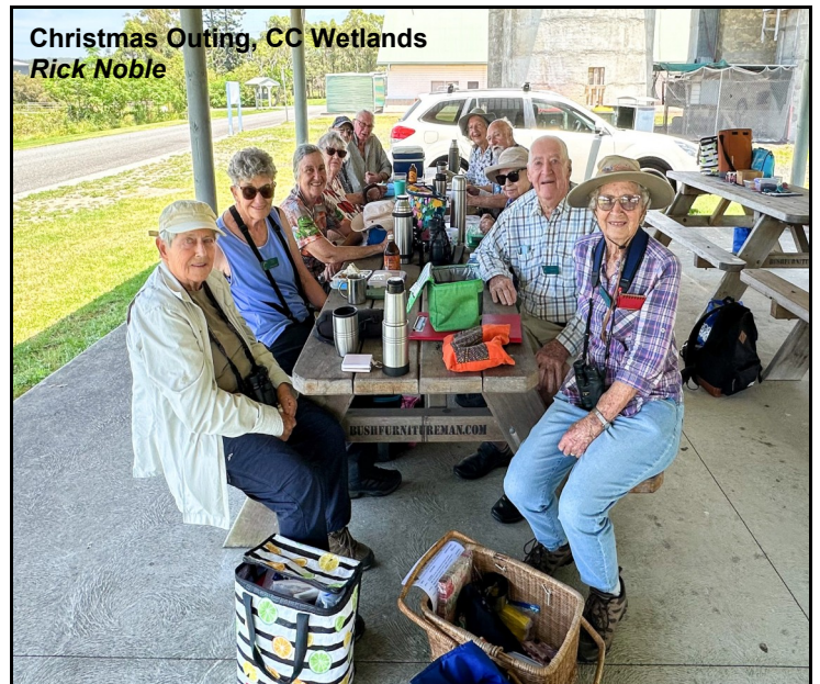
Christmas Outing, CC Wetlands