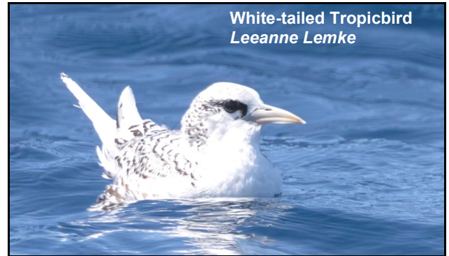
White-tailed Tropicbird Leeanne Lemke

2025 highlights included: Black-winged Petrel and 10,000+ Wedge-tailed Shearwater in January; Red-tailed Tropicbird, Black Petrel and Black-bellied Storm Petrel in February; Kermadec Petrel (2), Gould's Petrel and Brown Booby in March; over 30 Wilson's Storm Petrel in April; Northern Giant Petrel in both July and August; a high count of 9 Brown Skua in July; New Zealand Wandering Albatross in August (3) and October; Cook's Petrel and Long-tailed Jaeger in October and White-tailed Tropicbird in December, while Shy Albatross were seen on every trip except April.