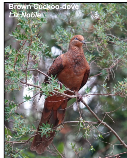
Brown Cuckoo-dove

Thank you to all who participated and I hope to see you all again in the new year.