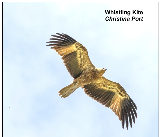
Whistling Kite Christina Port

Our last walk for the day was around the buildings and along the creek with several sightings of the Latham's Snipe, a Plumed Egret, Torresian Crow and Long-billed Corella. During the day the usual common water birds were noted, along with Wood Sandpiper, Black-fronted Dotterel & Buff-banded Rail.